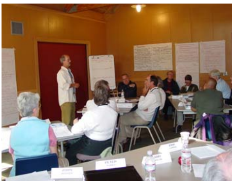
October 2007 Facilitator Training