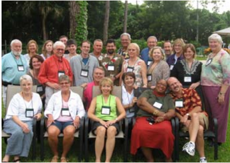
Participants at Duncan Conference Center October 2010