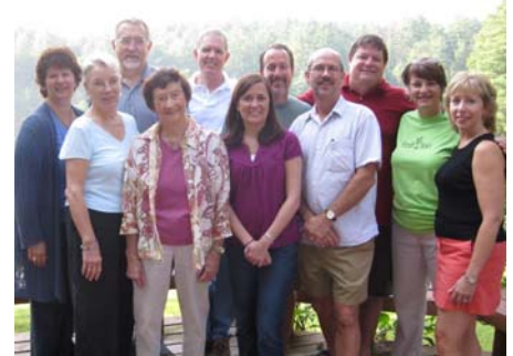
At Kanuga Conference Center September 2010

There was also a lively discussion about the possibility of using technology to offer Fresh Start to sparsely populated dioceses and to develop a greater sense of community among Fresh Start coordinators and facilitators around the country. No decisions (or funding) as yet – stay tuned!